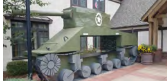
The "M4" Sherman Tank Bar

As attendees arrived at Villa Siena, they were greeted by a life-like Rosie the Riveter statue, a WWII jeep and soldier display, and 40's music delightfully sung by "Vocal-ease", the entertaining trio singing in the spirit of the Andrews Sisters.